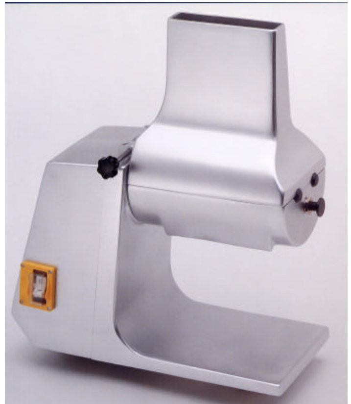
model shown ET180

All our products are manufactured under BS EN ISO 9001:2000 quality management system and are CE approved where applicable.