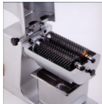
model ET180 with cover open