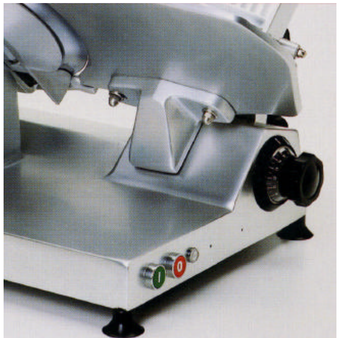
Rear view of AGS 300