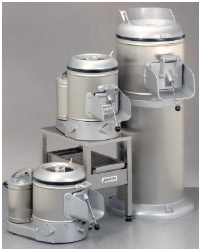
14DSWT model in the centre of a sample of our range of vegetable peelers.