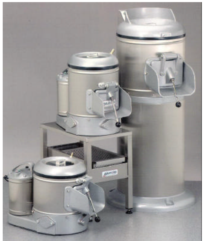
7D in foreground, with a sample of our range of vegetable peelers